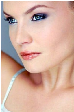
Nina 38D-34-45 Dress 18 Shoe 8